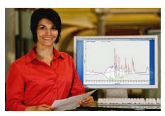
Customers can access their generation and usage data in a dedicated view.

For more detailed information, Visit www.wattsonsolar.com To become a Wattson Distributor, please contact sales@energeno.com