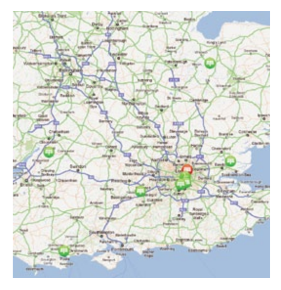
View installation base using the convenient dashboard.

The installer dashboard is web based so can be viewed on any internet enabled device from the office or on the move.