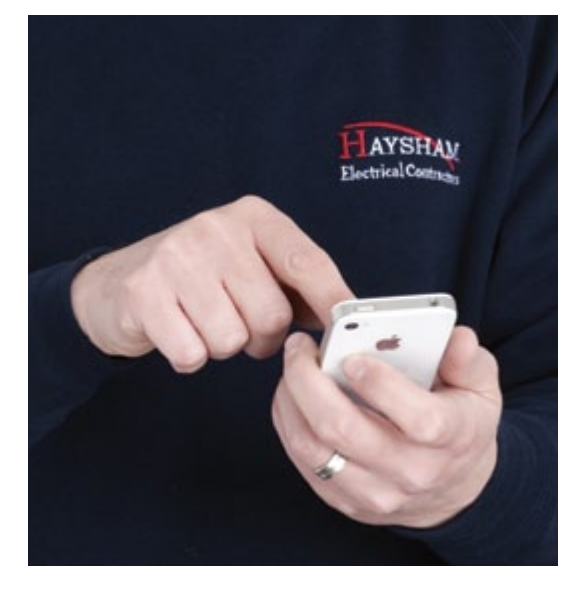
Receive notifications by email or SMS when on the move.